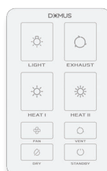
White Wall Controller (Included)

163mm Height - Minimum 200mm height clearance required