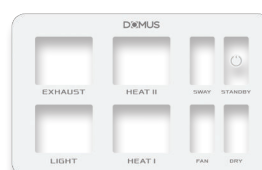
Horizontal Switchplate Film Cover (Included)