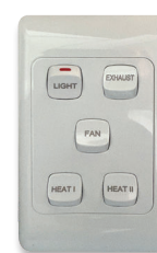
5 Gang Rocker Bakelite Wall Switch